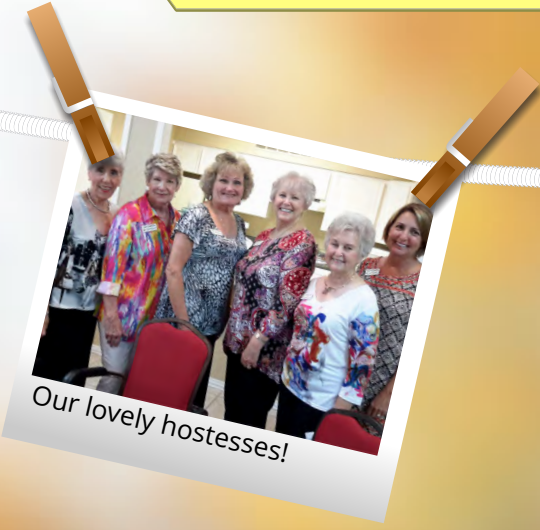
Our lovely hostesses!