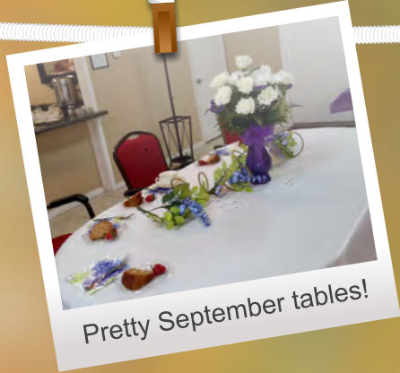
Pretty September tables!