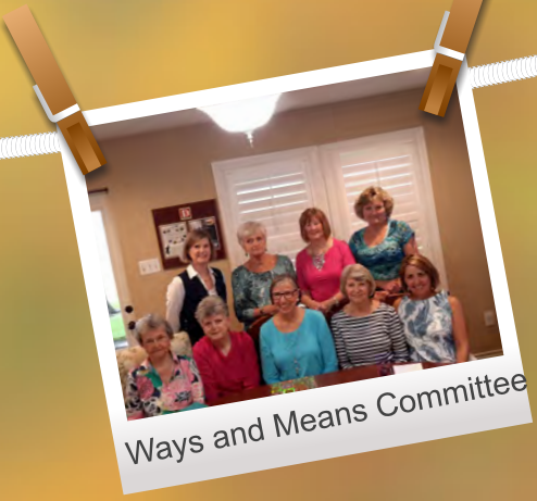
Ways and Means Committee