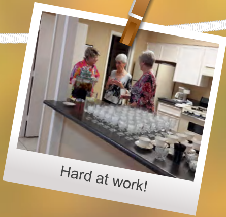
Hard at work!